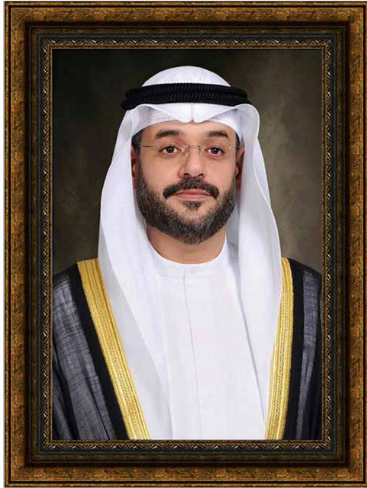
His Excellency Shk. Sultan bin Mohammed Bin Sultan Al Qasimi, Crown Prince - Sharjah Ruler's Deputy