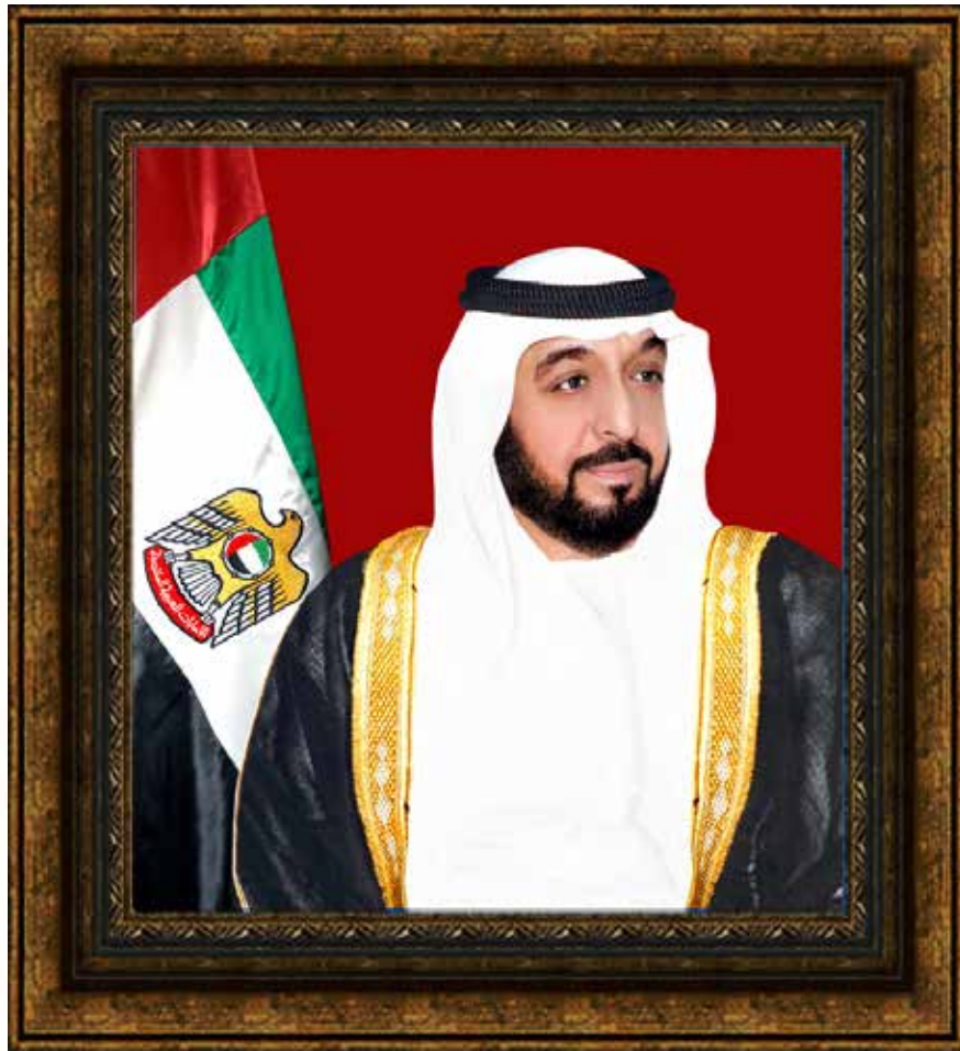
His Highness Sheikh Khalifa Bin Zayed bin Sultan Al Nahyan The President of United Arab Emirates