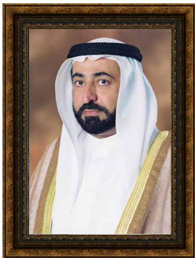
His Highness Shk. Dr. Sultan bin Mohammed Al Qasimi, Member of Supreme Council - Ruler of Sharjah